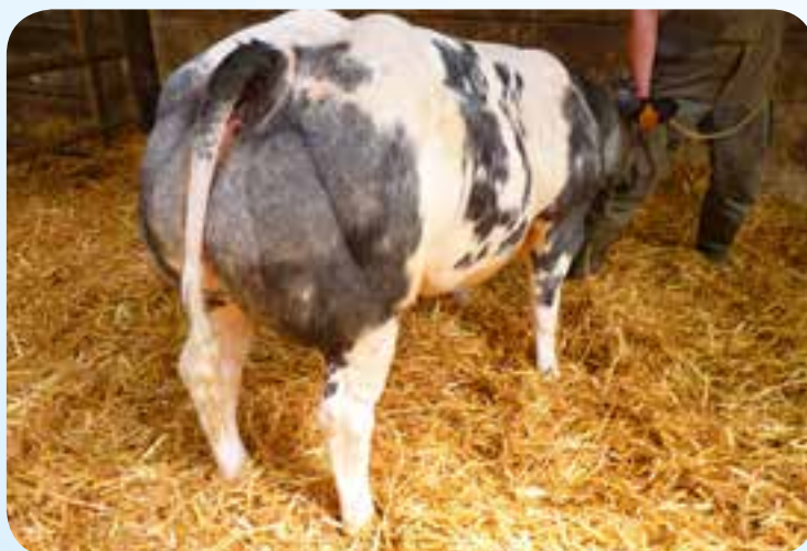
Vaucluse's calves at B. Lamblot