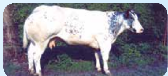
Kacahuète du Falgi 6 ans, 870 kg en prairie et 1,40 m