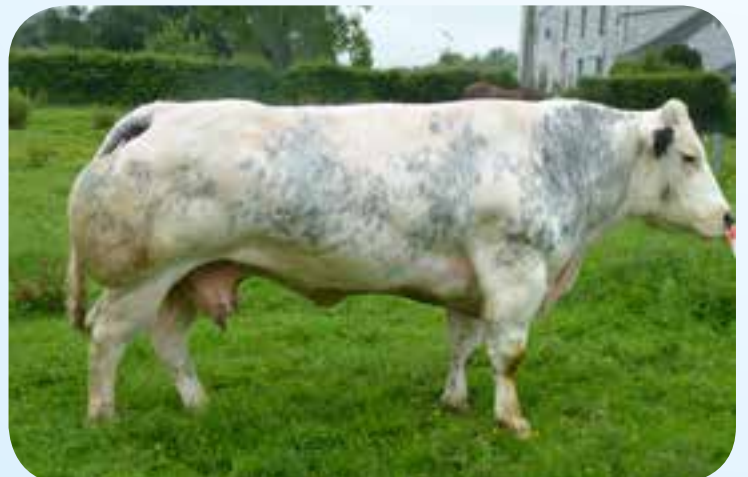
Hélise , mother of Oryx weighed 965 kg during the best judge contest in Porcheresse in May 2016