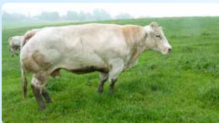
Indice, a great breeder from the Cortil Gayot farm. She is eight years old!