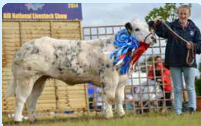
Ballinakill Holly, Hurricane's sister was also Irish champion and his mother, Ballinakill Beauty was a powerful cow that measured 1.46 m