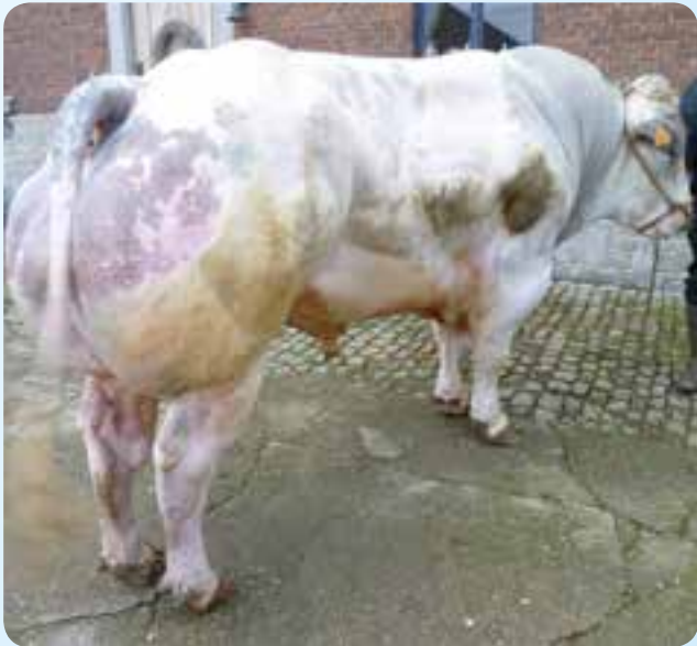
Puissant de Hotte, Kaki's son

All insemination centres dream of finding tried and tested bulls that are still operational. Kaki has fathered over 140 naturally calved calves with a loss rate of 5%. His carcass index would be 120 if his calves were born on several farms, his father Jackpot is a reference within the breed, his mother comes from the best Ochain breeding line, his half-brother Nayakou is the top seller at Fabroca and his son Puissant had all the makings of the heaviest of the race! How do you top that? Too bad that at 7 years ... he will never produce enough semen.