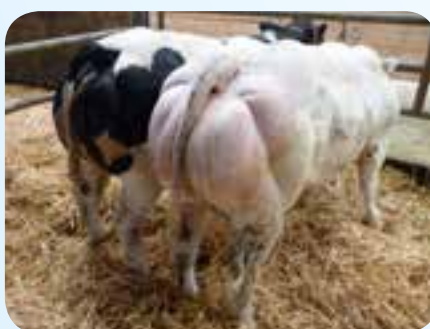
... lots of sorts ...