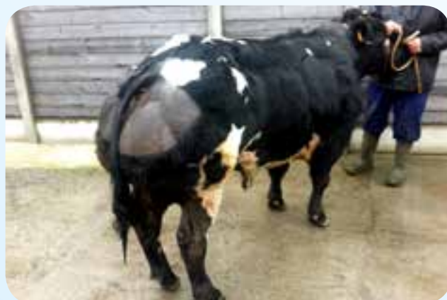
Dynamite's son at F. Vanderbiest in Moorsel

If Dynamite is the biggest seller at Fabroca, it is because his calves have notched up an almost clean run of successes in the 4 corners of the country!