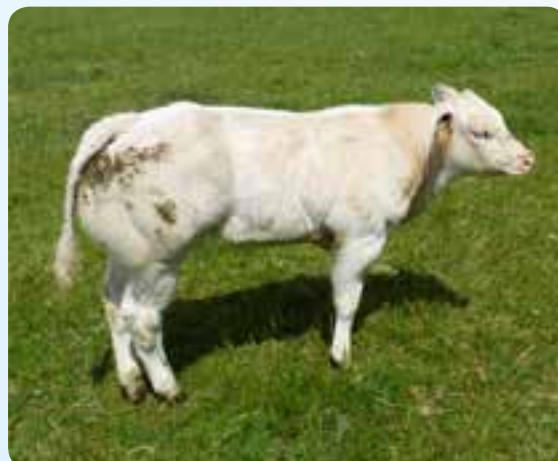
...feeding her fifth calf, Ganache's very own sister