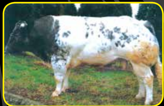
Opium has made cows the size of elephants! Always a good trait in a pedigree ...