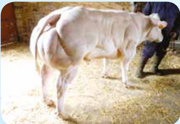
Grenat de Haute Somme was the dream of all breeders ... Fortunately, he was replaced by his brother Horace and now his son Oryx!