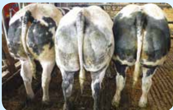
Cantona's daughters at Tihange, Custinne