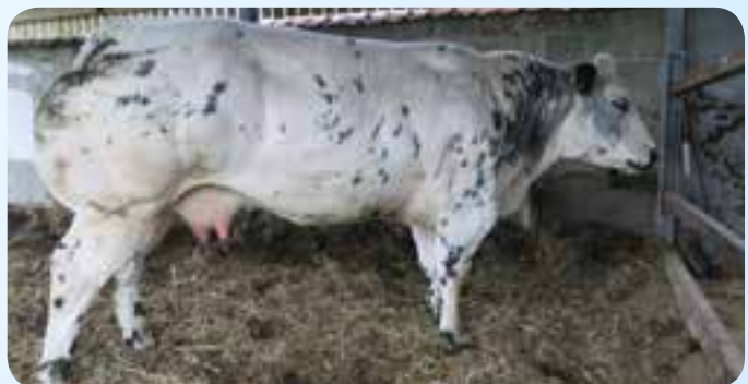
Mère de James Bond ci-dessus et grand-mère ci-dessous