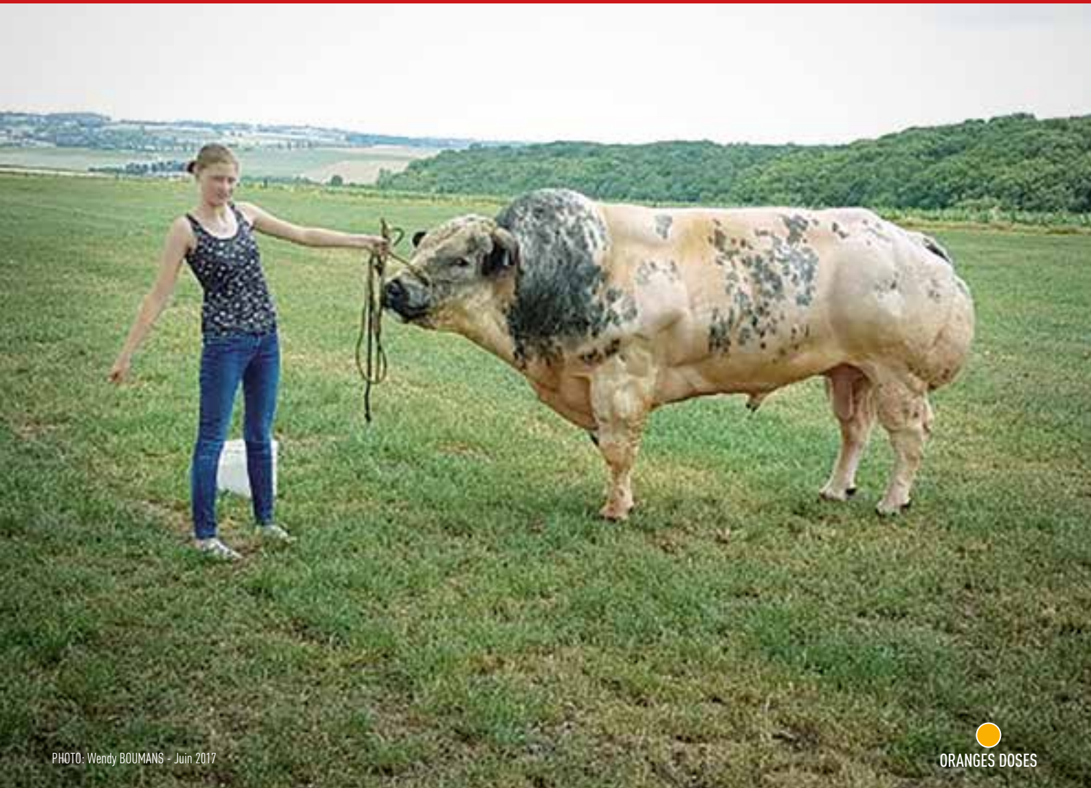
Juin 2017

He is still performant despite of his big age !