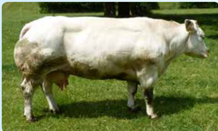
Agile d'Achet, now 140 cm ...