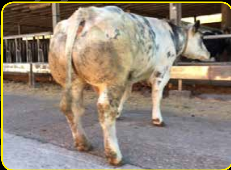
Yvonne Van Zeldonk, 3 years and 5 months, 840 kg, 1,40 m (+11)