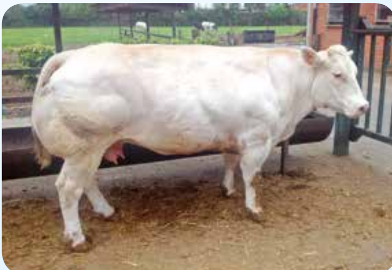
Ubidette du Falgi 5 suckling calves, 654 kg carcass