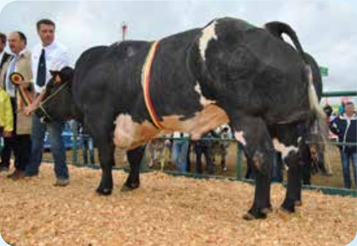
Pivert was crowned super champion among champions at Libramont 2015. For many experienced farmers, he could also be the champion of national champions!