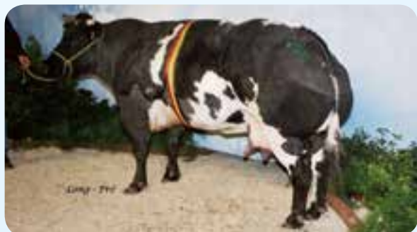
Elancée du Vanova, a national champion weighing one tonne