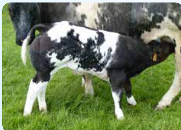
Still very young, the Manchester's calves are already lookers!