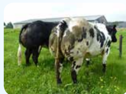
... that become heavy breeding females!