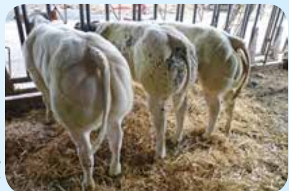
The first 3 daughters of Aladin at B. Cassart on Important, Sansonnet and Gagneur: a great model of economical breeding.

Aladin is a heavy and very complete bull whose parents and grandparents combine size and musculature.