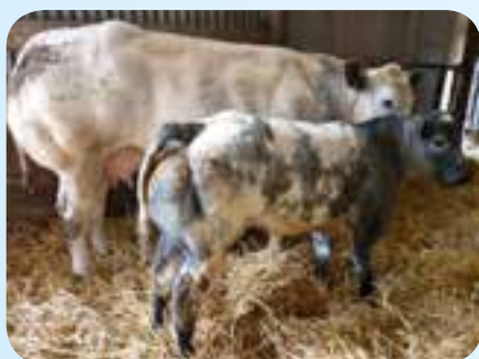
Calves that are easy to breed ...