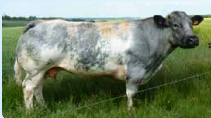
Irène (141 cm), a large, super-functional cow just the way we like them at Fabroca.