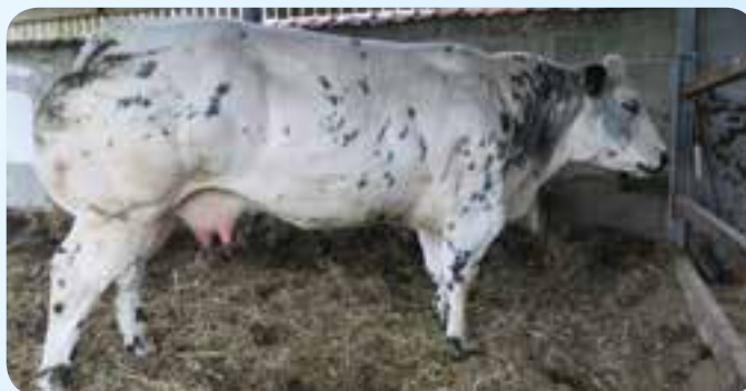
Mère de James Bond ci-dessus et grand-mère ci-dessous