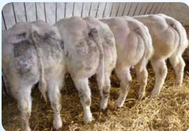
Calves of Neptune