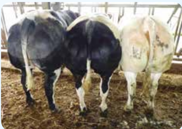
The 3 first daughters at Benoit Cassart, in Porcheresse