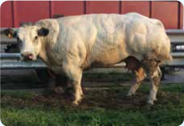
Pivert's mother came in at 920 kg in her tenth year, having raised suckling calves. A phenomenal front and a wonderful head ... Like her son!