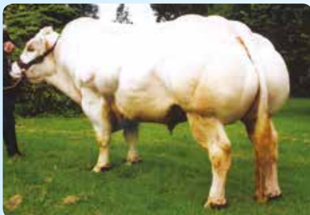
Rocky at Pont de Messe Reference economic performances

Edifiant is the darling of the fatteners-breeders who know that the weight lies in the length, back and front.