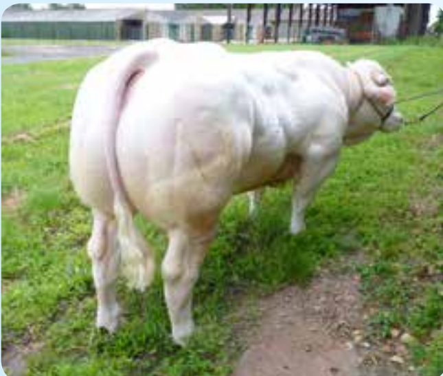
At 18 months, Imposant already weighed 857 kg.