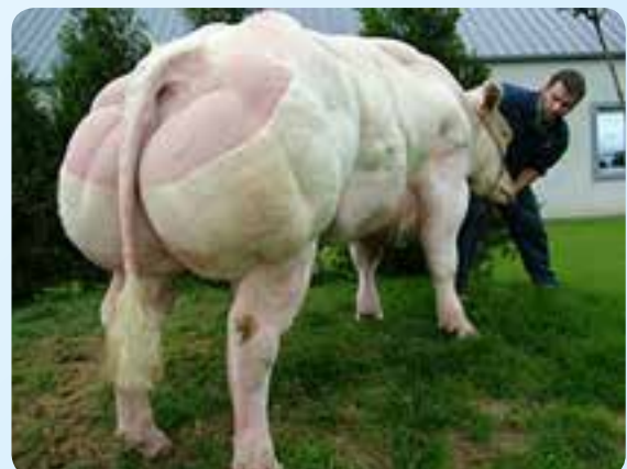
Obus has given us some good memories ... he is also Horace's father