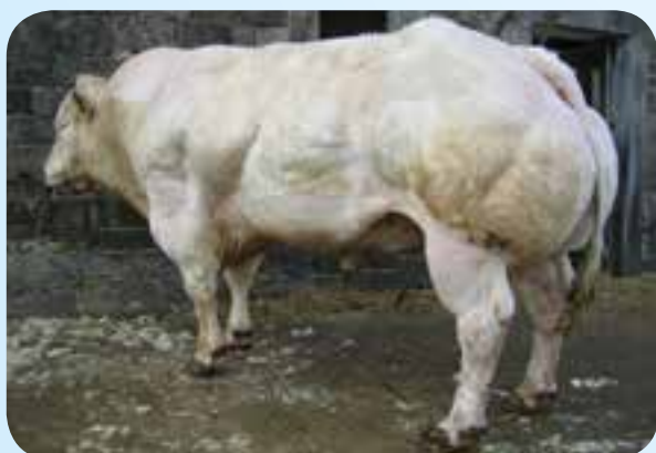
Diable, one of the first Fabroca bulls, largely contributed to the brand image of the centre: fertility, facility, vitality and growth. Neptune is a worthy heir!