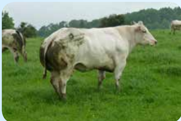
Mother of T'es Beau