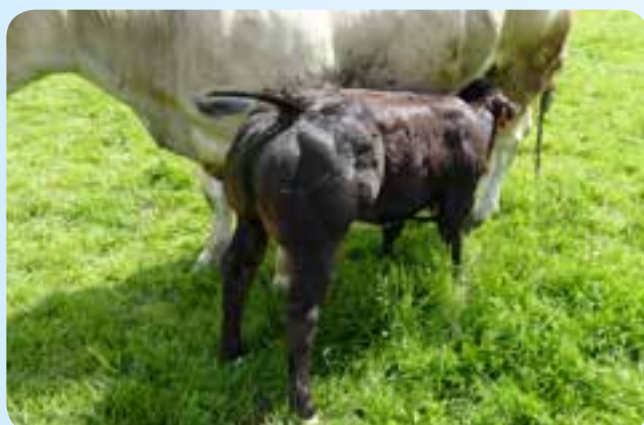
Xylophone X Ecolo at B.Cassart: Jean Mailleux's super type is always needed ... even on crossed breeds!

Xylophone is just the right type. He is even a perfect match for cross-bred animals by adding finesse and musculature.