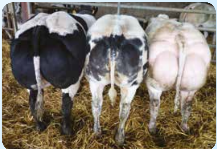
2 bulls and 1 heifer of Kilowatt at F. Cosse & Fils in Jauvelan