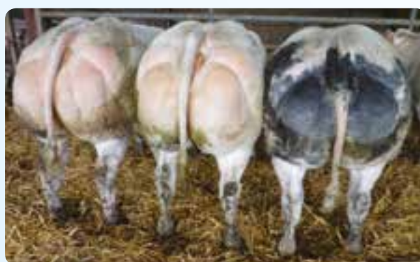
Calves at F. Cosse & Fils in Jauvelan