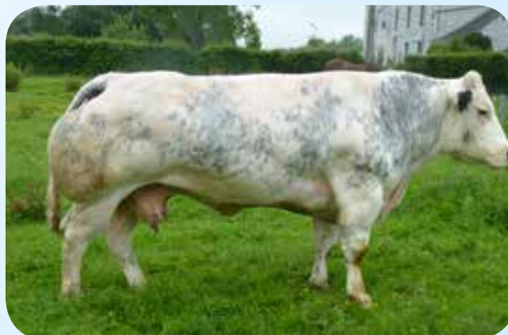
Hélène , mother of Oryx weighed 965 kg during the best judge contest in Porcheresse in May 2016