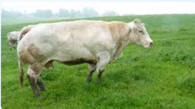
Indice, a great breeder from the Cortil Gayot farm. She is eight years old!