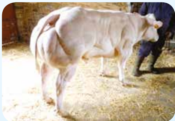
Grenat de Haute Somme was the dream of all breeders ... Fortunately, he was replaced by his brother Horace and now his son Oryx!