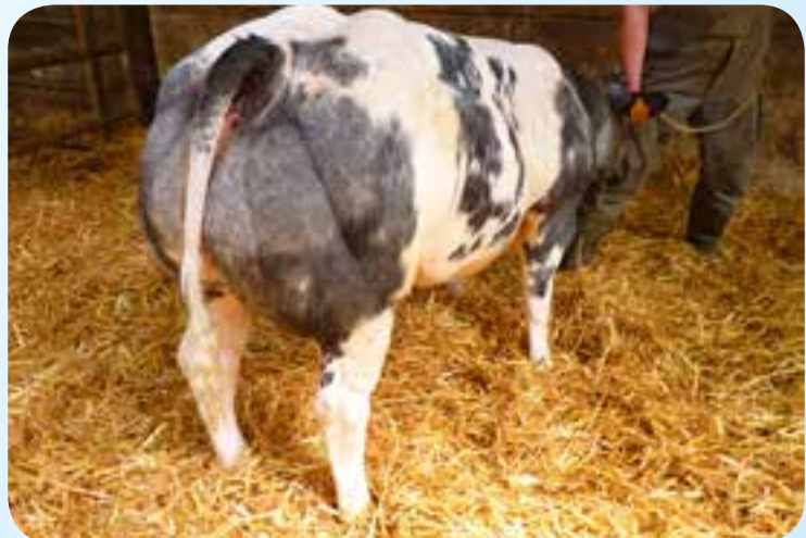
Vaucluse's calves at B. Lamblot