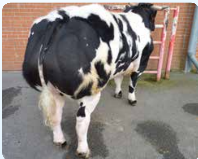
James Bond, excellent thickness