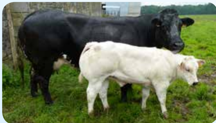
The first calves of T'es Beau have a good roundness but also have a good length. He imposes its breed on crossbred animals.