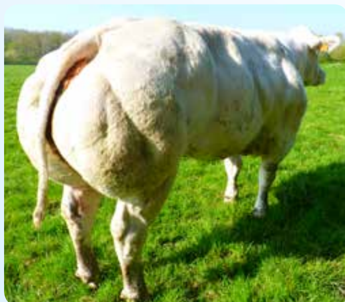
The mother of Horace: EXCEPTIONAL build (1.47 m (+ 15)), an origin, a conformation and breeding!!!