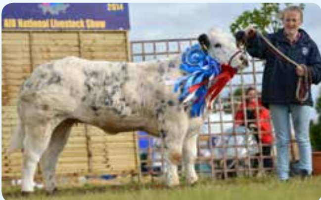
Ballinakill Holly, Hurricane's sister was also Irish champion and his mother, Ballinakill Beauty was a powerful cow that measured 1.46 m