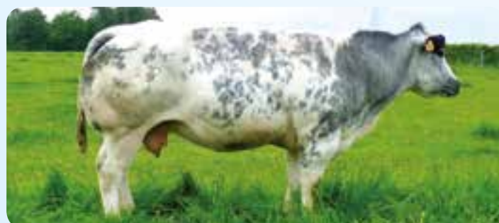
Cavalière at Pont de Messe A big fat beef cow from an exceptional lineage