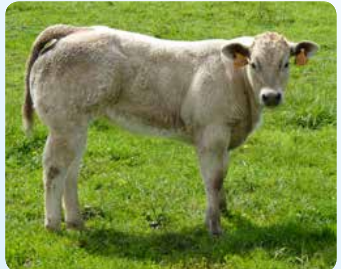
Of all the crossbred calves from the Fabroca bulls, the Imposants are the thickest.