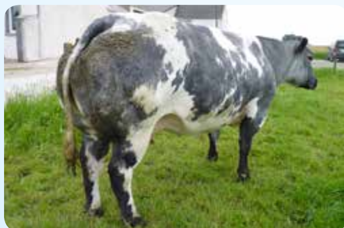
Ultime, a big cow like Giga knows how to do it.