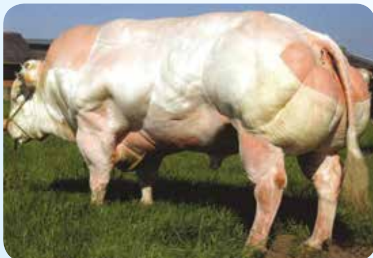
Ecrin de Wihogne