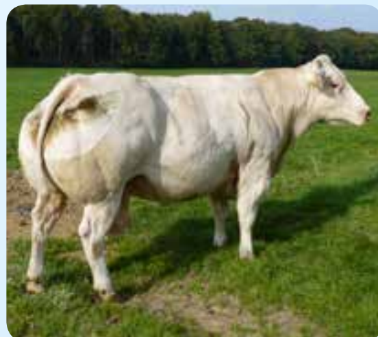
Hilarité d'Ochain, 1049 kg, 1.43 m in the meadow ...