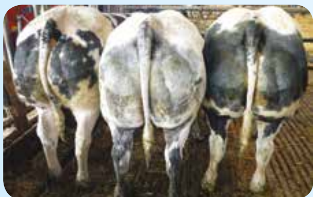
Cantona's daughters at Tihange, Custinne

To correct the inbred small meaty animals, opt rather for Dandi, Goulou, Gagneur or even better ... our French bulls!