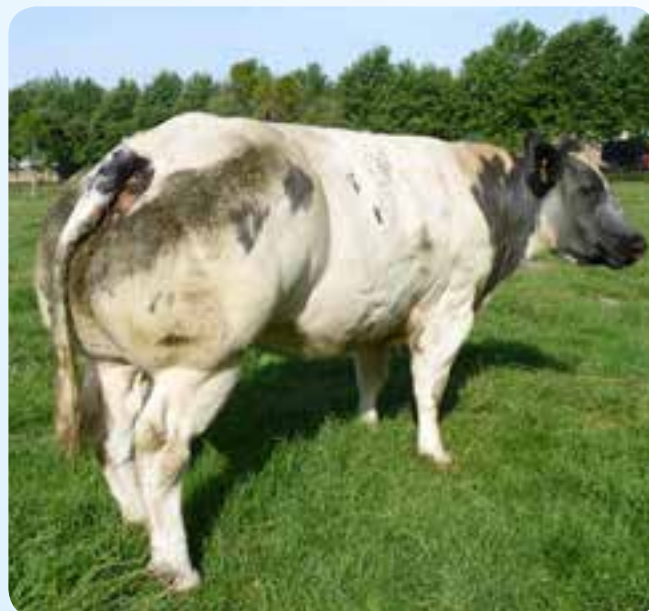
Maillon's mother deserved a better name