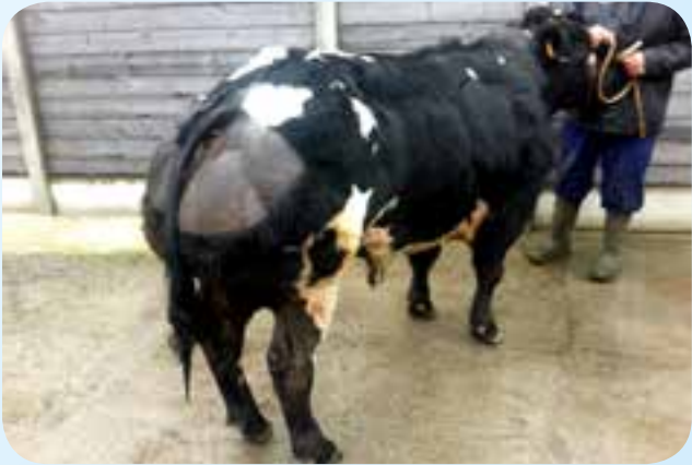
Dynamite's son at F. Vanderbiest in Moorsel

If Dynamite is the biggest seller at Fabroca, it is because his calves have notched up an almost clean run of successes in the 4 corners of the country!