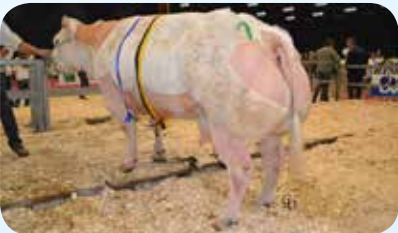
Eristoff daughter of Aphrodite, provincial champion in Ciney in 2014, 933 kg at 3 years and 10 months.