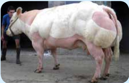
Aphrodite at 5 years. She was national heifer champion in Libramont in 2011.