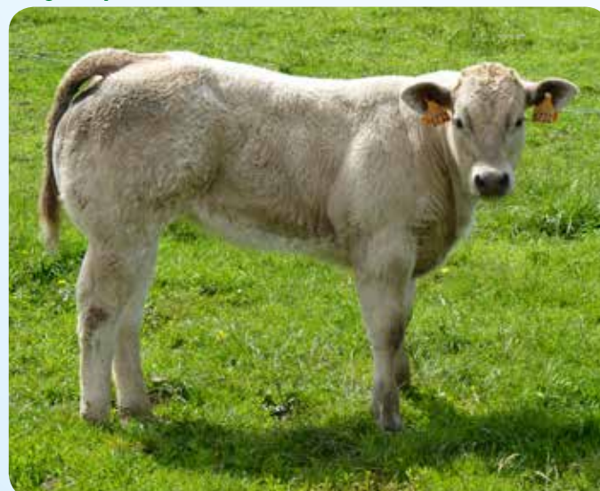
Of all the crossbred calves from the Fabroca bulls, the Imposants are the thickest.