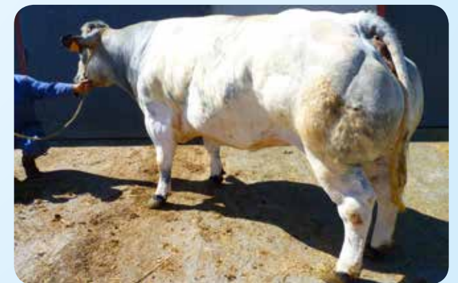
Manifeste de Hotte: 4 years and already three calves, excellent maternal qualities and an ideal calving interval.