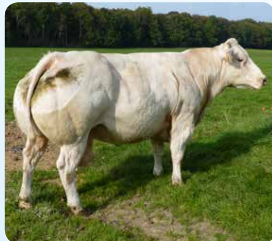
Hilarité d'Ochain, 1049 kg, 1.43 m in the meadow ...