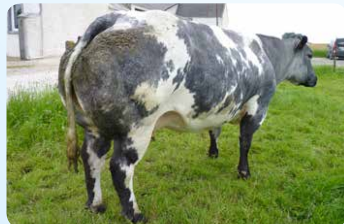
Ultime, a big cow like Giga knows how to do it.

The Beaufaux livestock farm is one of our favourite sources, not only due to the intelligence and human qualities of the breeder, but also due to the high level of its cattle. This is the home of the father of Empire, the great-grandfather of Dafydd and Rutabaga. What a stroke of genius to cross the Fringant the great with Giga the giant! Do you remember the mothers of these two studs?