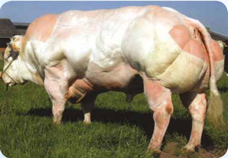
Ecrin de Wihogne