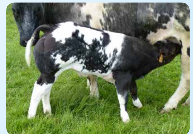
Still very young, the Manchester's calves are already lookers!