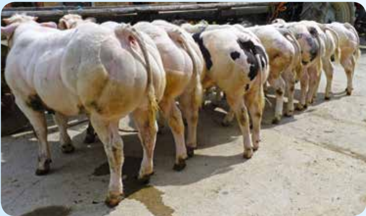
Calves from Iguanodon at JP-Polet in Schaltin (0472 79 15 49): «I've always succeeded with Ochain's gene stock and to take over from Empire, which I was fortunate to have in my herd, I chose Iguanodon and I'm very happy with the result!»