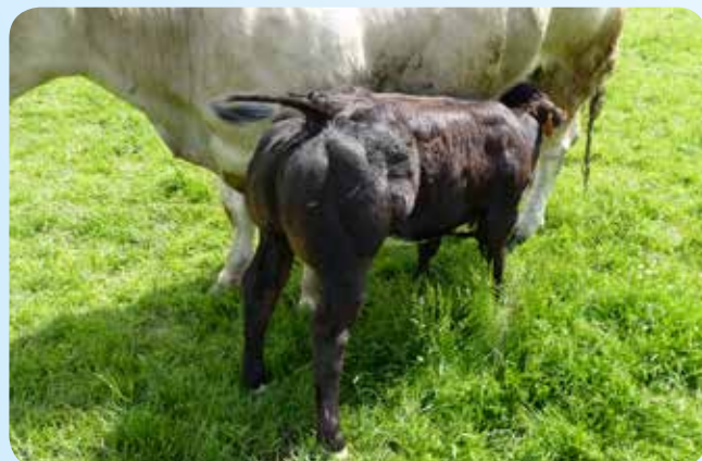
Xylophone X Ecolo at B.Cassart: Jean Mailleux's super type is always needed ... even on crossed breeds!