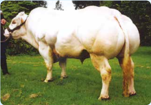
Rocky at Pont de Messe Reference economic performances

Edifiant is the darling of the fatteners-breeders who know that the weight lies in the length, back and front.