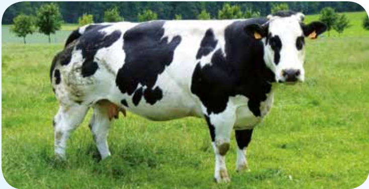
Energie d'Ochain 1.45 m (+13) and 1034 kg on 26 June 2010. In 2011, after pasturing, she was sold for BEF 102,500 + VAT on Ciney market! Today, this would be worth around 3500 euros ...