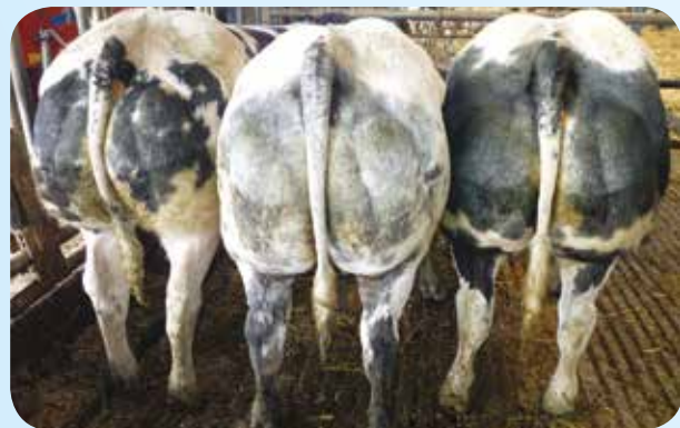
Filles de Cantona chez Tihange à Custinne, élevage de la Grigeoule

To correct the inbred small meaty animals, opt rather for Dandi, Goulou, Gagneur or even better ... our French bulls!