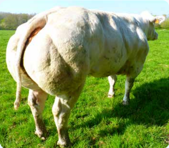
The mother of Horace: EXCEPTIONAL build (1.47 m (+ 15)), an origin, a conformation and breeding!!!