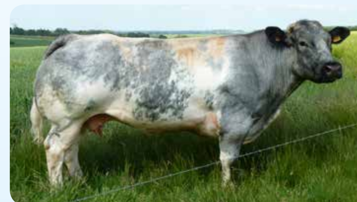
Irène (141 cm), a large, super-functional cow just the way we like them at Fabroca.

10 years after Empire d'Ochain, Fabroca offers Manchester du Bois Remont, to replace him in your heart!