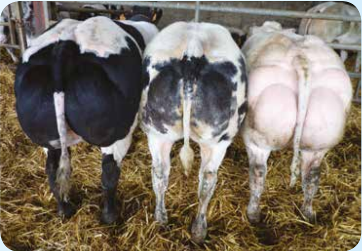
2 bulls and 1 heifer of Kilowatt at F. Cosse & Fils in Jauvelan