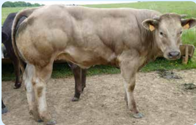
«For me, Farouk's daughters boast all the breeding qualities sought by Fabroca, both on the BBB and on cross-bred mothers.» B. Cassart