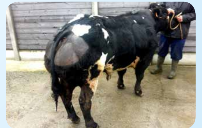
Fils de Dynamite chez F. Vanderbiest à Moorsel