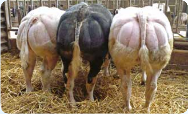
The 3 first calves at P. Brumioul, in Rocourt