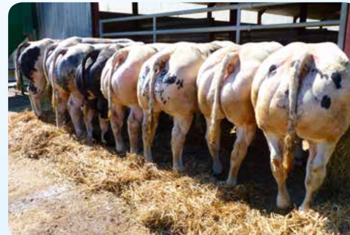
Lot de Kaki ... who is the father of Puissant but also the great half-brother of Nayakou. A real stud, he gave 82 impeccable calves through natural insemination... because he never let his sperm be collected.