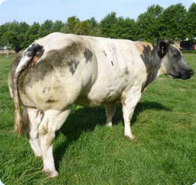
Maillon's mother deserved a better name