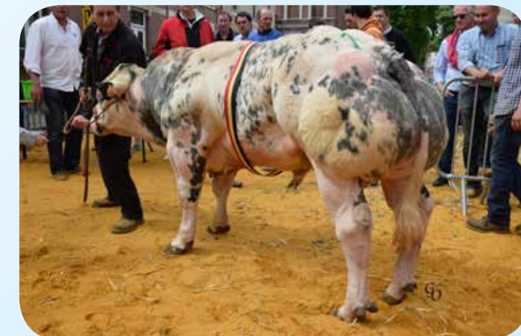
Fils d'Obligéant (X Important) chez B. Lamblot, champion Jedoigne 2015.