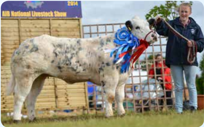
Ballinakill Holly, Hurricane's sister was also Irish champion and his mother, Ballinakill Beauty was a powerful cow that measured 1.46 m