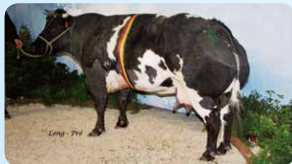
Elancée du Vanova, a national champion weighing one tonne