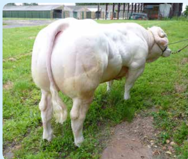
At 18 months, Imposant already weighed 857 kg.

A pelvis of an exceptional width, a back like a table and leather that is the finest ever seen on a Charolais by the Belgian specialists of the double-musled Charolais.