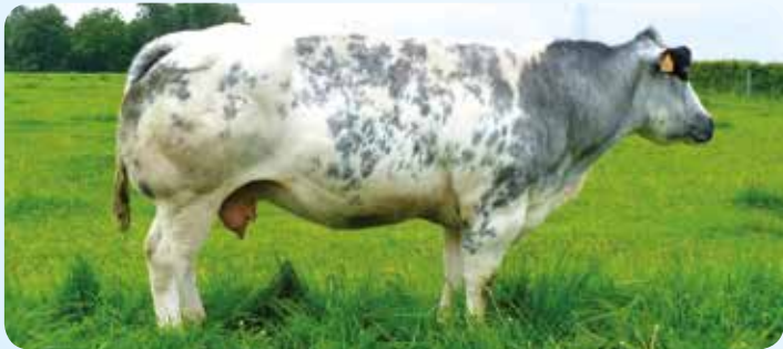
Cavalière at Pont de Messe A big fat beef cow from an exceptional lineage