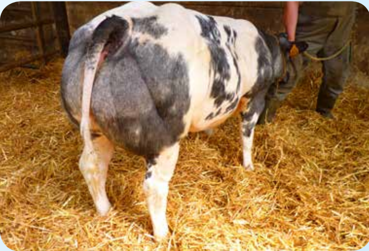
Veau de Vaucluse at B. Lamblot